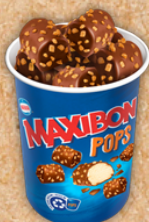
MAXIBON POPS 4,00€