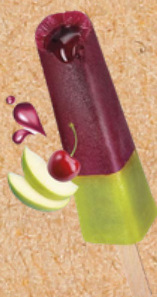
PIRULO FRUIT EXPLOSION (GLUTEN FREE) 3,00€

ICE CREAM · HELADOS · GELATS · CRÈME GLACÉE IJSJES · EIS