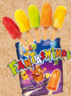
PIRULO FANTASMIKOS 3,25€