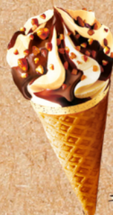
EXTREME DOBLE VAINILLA 3,50€