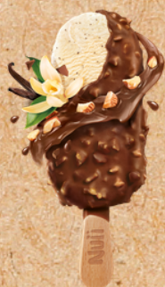
ALMENDRADO CON VAINILLA DE JAVA (GLUTEN FREE) 4,25€