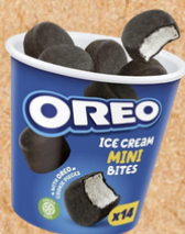
OREO MINI BITES 4,00€